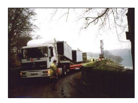
An example of an unplanned response to draw down a reservoir

It is essential that the on-site plan is kept up-to-date. Staff, panel engineers and external organisations that have a role to play in the emergency need to be trained and practice exercising the plan. The on-site plan should set out the training programme for those responsible for managing and implementing the plan. It should outline the level, type and frequency of exercise, where the emphasis is on internal and external coordinated communications and actions. It should also cover externally resourced plant and equipment, and assess the adequacy of this supply chain. Every exercise should include a formal debriefing and lessons learned report, with changes to the on-site plans, where appropriate, as part of continuous improvement. The value of exercising cannot be over-emphasised. A paper ((Brown, Gardiner and Williams, 2010) by reservoir managers representing four of the largest undertakers states: "The risk to the business should these exercises not be carried out is far greater than the cost of the management of a major incident. Exercising the contingency plans highlights gaps in the knowledge and incident procedures."